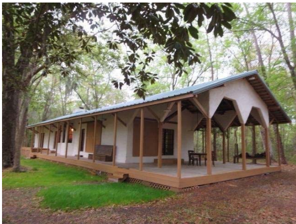
The former ACL RR Longwood, FL depot in its Current configuration as a residence in Hilliard, FL