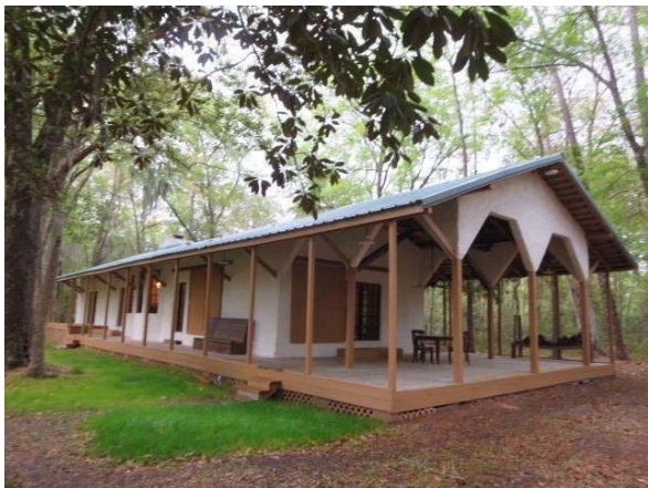
The former ACL RR Longwood, FL depot in its Current configuration as a residence in Hilliard, FL