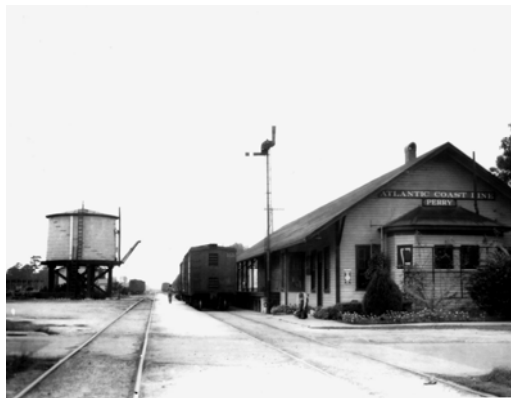
This is ACL's Perry depot where their famous Southland made its first Florida stop on its run from Chicago and the Midwest to Florida's West Coast. The Perry stop was mainly to serve the nearby winter resort at Hampton Springs. Once the Perry Cut-off was completed in 1927, this new route bypassed Jacksonville, saving 92 miles, and made the Southland the fastest train from the Midwest to Florida's West Coast. Perry was known as the Gateway to Florida's West Coast.