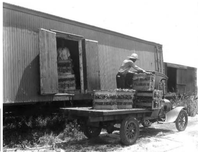
Workers loading celery in a reefer car in Leesburg in 1926. Historic Florida X.