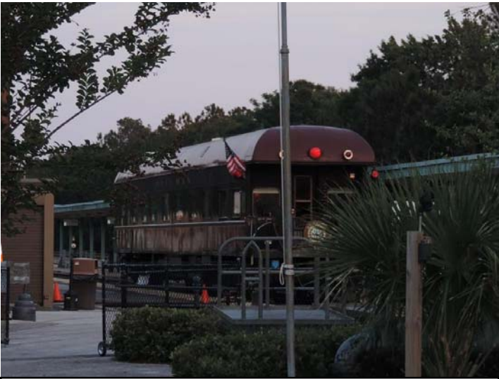
Private Car Dearing