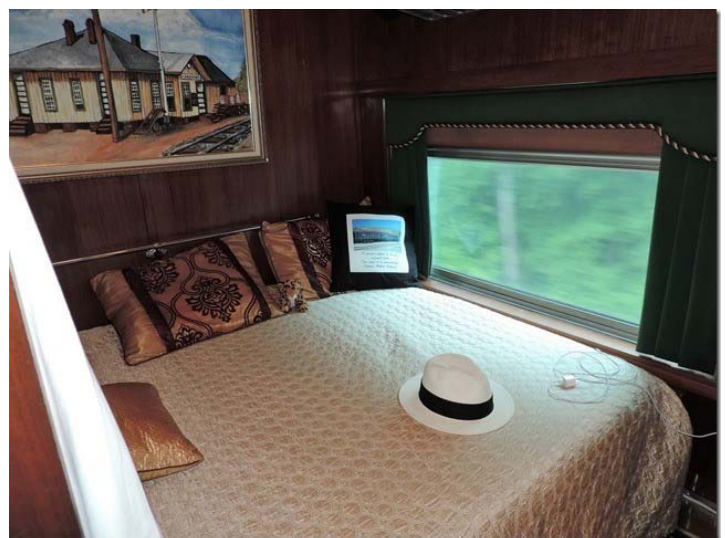
Private Car Dearing Large Bedroom