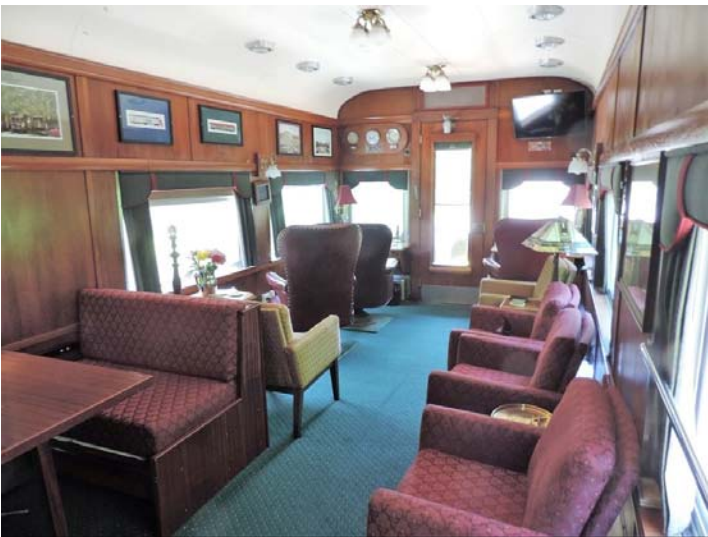
Private Car Dearing Lounge Area