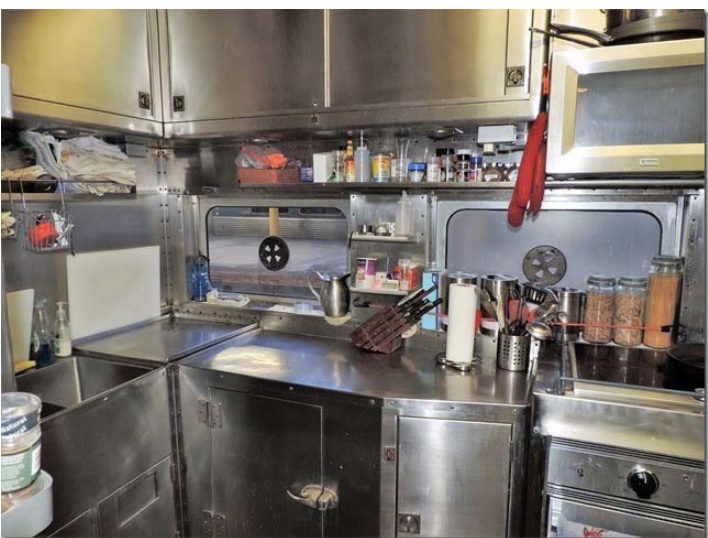
Private Car Dearing Kitchen