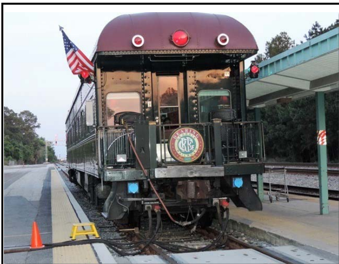
Private Car Dearing in Jacksonville, Florida

June 2017 Museum Work Session Saturday, June 17, 2017 8:30 AM to 3:30 PM