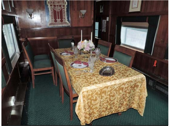
Private Car Dearing Dining Area