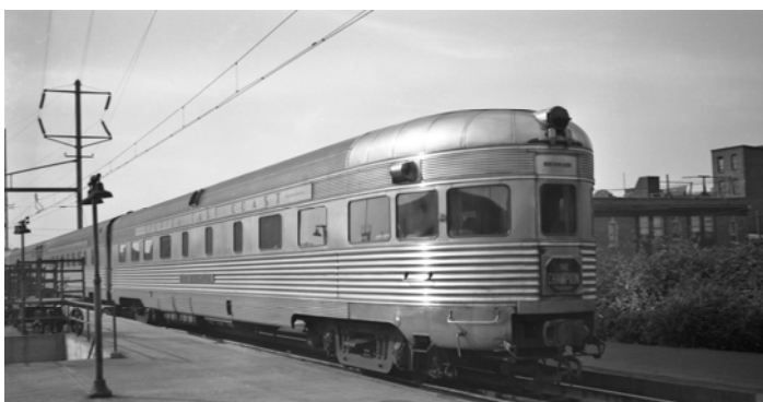
ACL's Champion with FEC round-end, tavern-observation Biscayne Bay bringing up the markers, was running under the wires on the Northeast Corridor, and no doubt, there is a Pennsy GG-1 on the point. What class!! This car was purchased by the SAL after the FEC strike and became their 6607.