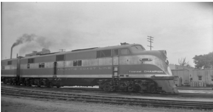
ACL's coach-Pullman Champion from New York City, with E3A 500 on the point, was on the FEC in Miami in 1941. All ACL Miami bound trains ran over the FEC from Jacksonville until the FEC strike of 1963. The locomotive was from the West Coast Tamiami Champion but was leading the East Coast Champion . This illustrates why train names were soon deleted from the locomotives. In 1949 the Champion was officially renamed the East Coast Champion .

This monthly photo column by Ken Murdock features railroad scenes of the past, a look back into railroading's history.