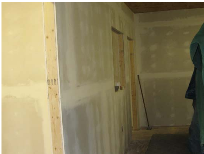
Two Photos Of Work Progress In Roper Building

2017 is off to a great start and I want to thank all of you who have participated by hosting, helping on workdays or doing projects at home. We couldn't do it without you!!! +++++