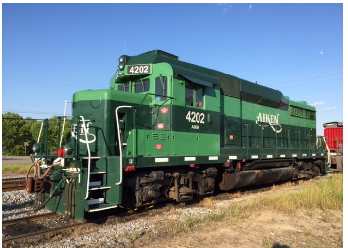
The Aiken Railway Company operates 19 miles of line in Aiken County, SC.