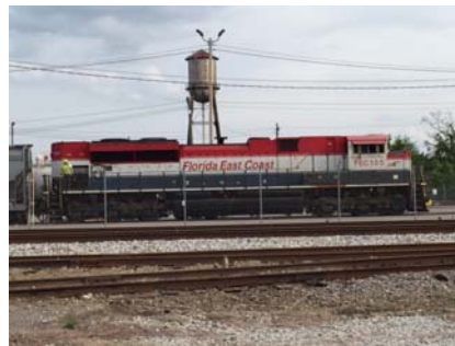
FEC 105 Switching in the Augusta, GA area while on lease. 4/9/16.

May 2015 Museum Work Session Saturday, May 30, 2015 8:30 AM to 3:30 PM Please come out and help with the many chores that need to be done!!!!