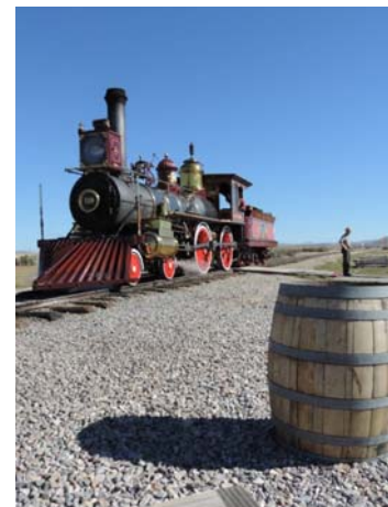
#109 approaches the meeting point.

This plaque is attached to the replica of the last tie where the Union Pacific and Central Pacific were joined.