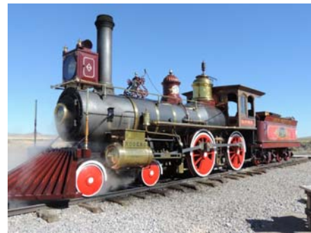
A close up view of #109.