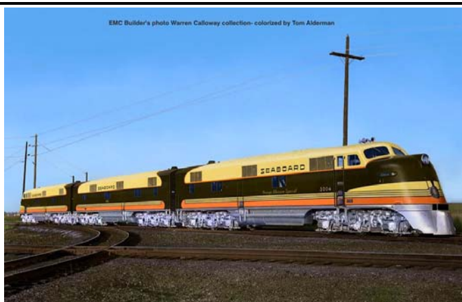
SAL E-4 A-B-A set built by EMC circa 1938.