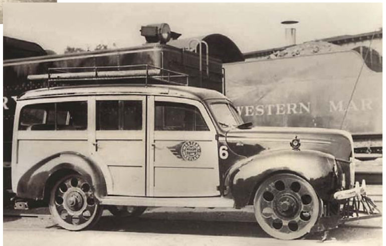
1940 "Woody" rail inspection car on the Western Maryland Railway.