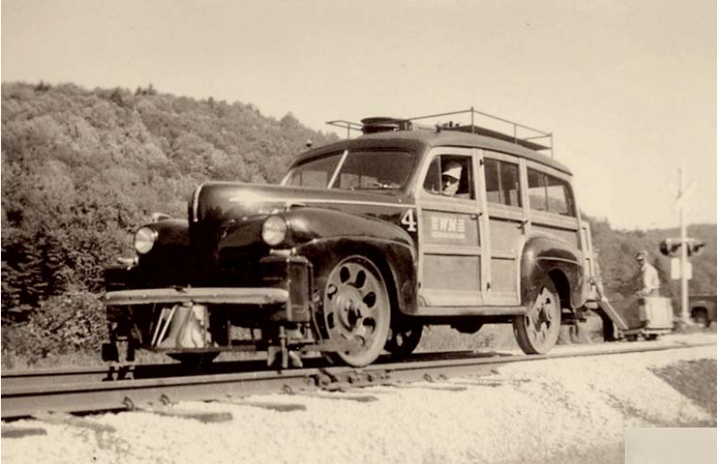
1941 "Woody" rail inspection car on the Western Maryland Railway.