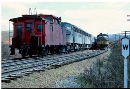
Society's caboose (former CRR #1073) in service near Johnson City, TN.