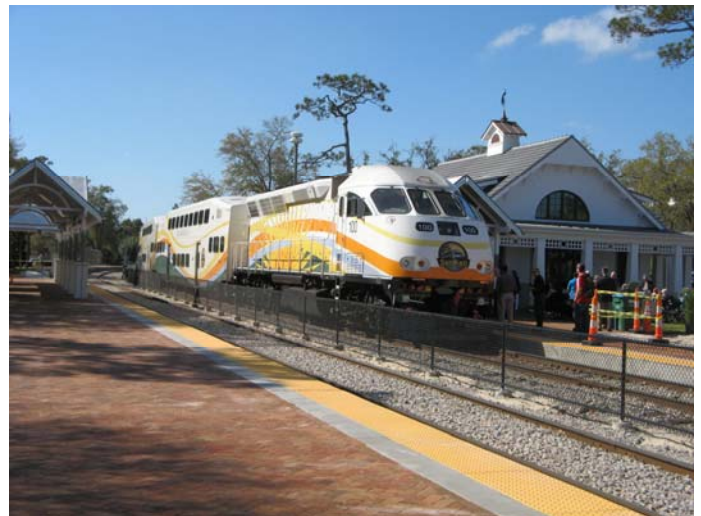
SunRail's display train at Winter Park's new depot dedication had two coaches, the last one being a cab control car. SunRail's standard seems to be the cab control car in the lead south bound and the locomotive in the lead north bound.