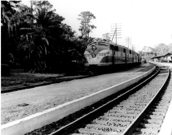
ACL's purple and silver E7A #529, only a year and a half old, with a south bound train, probably the West Coast Champion, has made a stop at Winter Park's second depot on January 8, 1947.