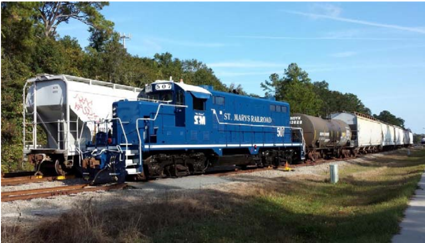
St. Marys GP16 switches freight cars.

Increase our freight business utilizing vacant properties and existing industry adjacent to the railroad. Increase number of excursions so as to attract larger groups. Do a Day Out with Thomas event.