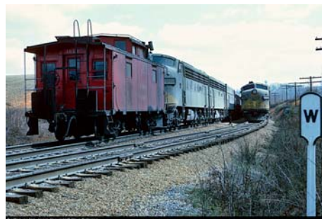
Society's caboose (former CRR #1073) in service near Johnson City, TN.