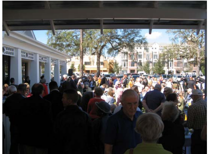
A large crowd had gathered for the ceremony. The speaker's podium was located between the center set of columns on the left (third space from the far end), almost not visible from this angle.