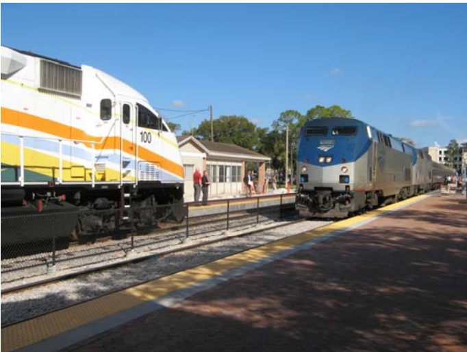
Amtrak's south bound Silver Star made a station stop just before the ceremony bring the nose of their lead locomotive #159 almost nose to nose with SunRail's #100.