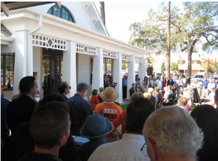
Congressman John Mica, 7 th Congressional District of Florida, is between the center set of columns to the left, addressing the crowd. He seemed almost relieved that this long fought for project was finally becoming a reality.