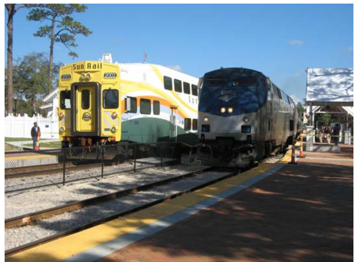
The Silver Star had to make a second station stop, due to platforms south of Morse Blvd not being open, thus bringing their lead locomotive #159 right alongside of SunRail cab control car #2003.