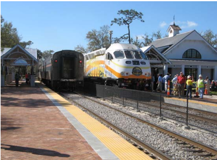
The Silver Star departs Winter Park for Orlando with a Heritage baggage car on the rear behind a Viewliner sleeper. No class!