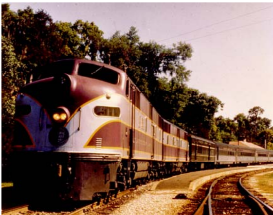
ACL's E7A #511 north bound has made a station stop in Winter Park on August 11, 1960 with a train that is probably the West Coast Champion. The roof of the depot can be seen over the top of the train. Still in purple and silver, the black and yellow paint scheme had been introduced in September 1957 and can be seen on the RPO car following the locomotives.