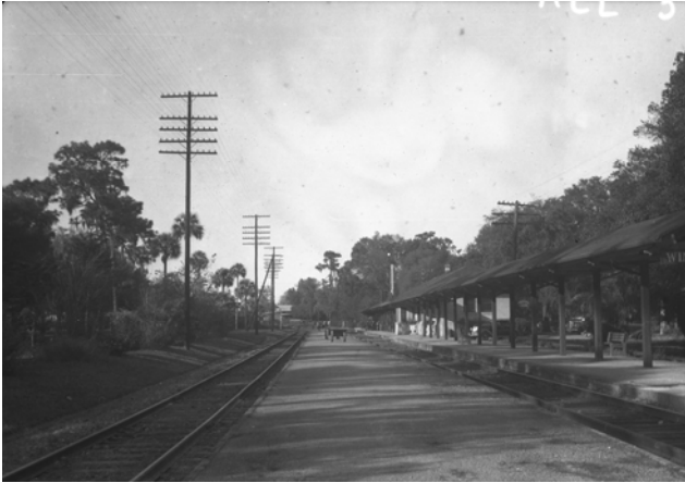
Winter Park is getting its fourth depot this year and most of us don't remember its first or second ones. This circa, 1935 photo shows their second depot, built by the ACL and located on the east side of the tracks where Morse Boulevard crosses today. The depot was accessed via a bricked cul-de-sac off of Park Avenue.